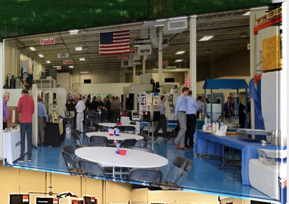
Pictured Right: VMC Open House