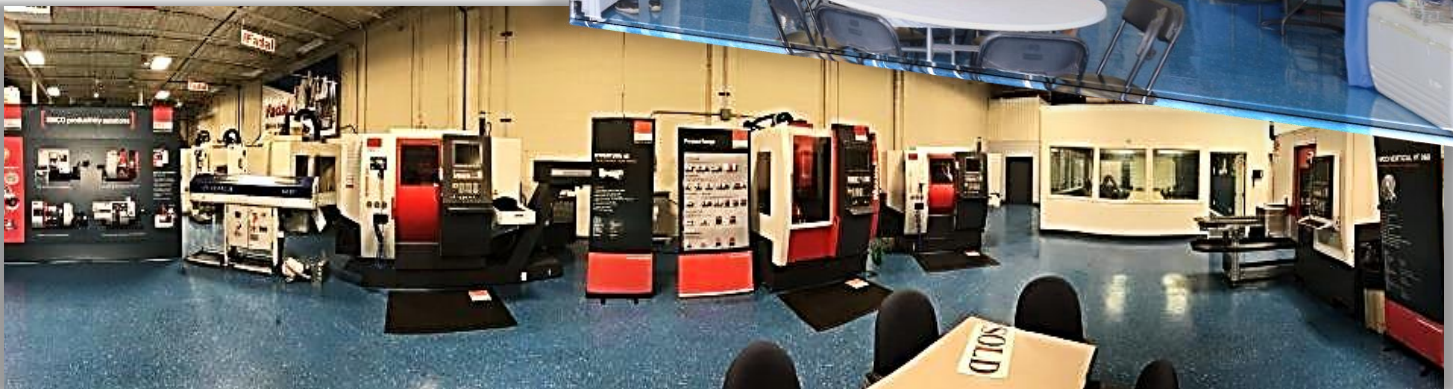
Pictured Below: VMC/Emco Showroom