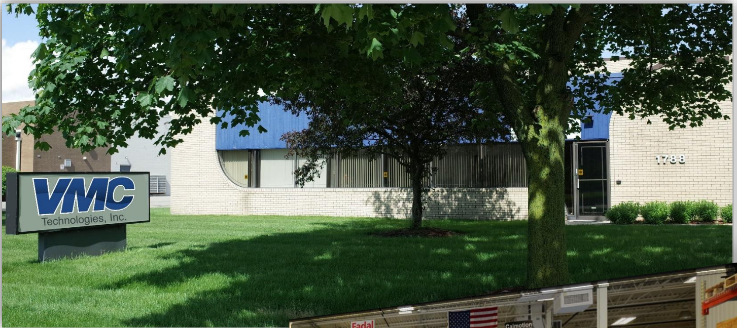
Pictured Above: VMC Tech Building Front Exterior

Come visit our SHOWROOM! . . . . . No commitment. No Pressure. We have machines here ready for you to come view or demo and we look forward to meeting you!